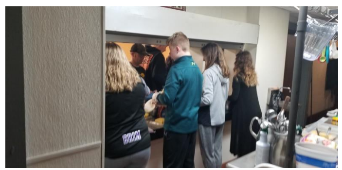
Serving tacos at Beacon of Hope