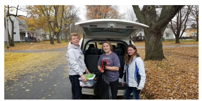
Warm Hearts Warm Homes

Our Confirmation class has been busy in November! On November 3, our confirmands participated in Warm Hearts Warm Homes and weatherized 2 homes. On Friday, November 9, they travelled to the Temple Bnai Jehurun in Des Moines to participate in a Shabbat service, tour the temple, and learn more about Judaism. On Sunday, November 14, they helped package Minestrone soup for Kids Against Hunger, and all together over 80 volunteers packaged 26,137 meals that day! And on November 28 our confirmands travelled to Beacon of Hope men's homeless shelter to serve a meal of tacos and fixin's to the men. Well done, confirmands!