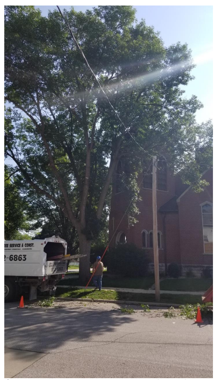
On August 22 we removed this old friend from our church grounds. Lightening damage and decay had taken its toll on this ash tree--a memorial planted in memory of Gary Yungclas in 1970.

This bat was found sleeping under the crumpled tape used to seal off the windows. Chris McNiel happened to stop by right after this discovery and he easily relocated the bat to the great outdoors.