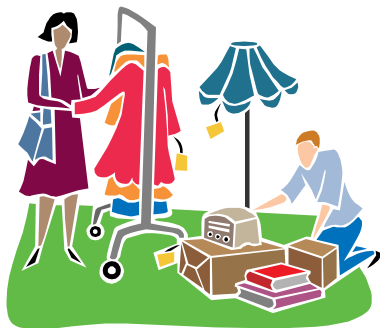
Chairperson, Thrift Sale

Thank you to each of you who helped donate, sort or unbox items, clean-up and haul the leftovers, bring food for workers, or work during the sale. This project could not be done if not for each of you.