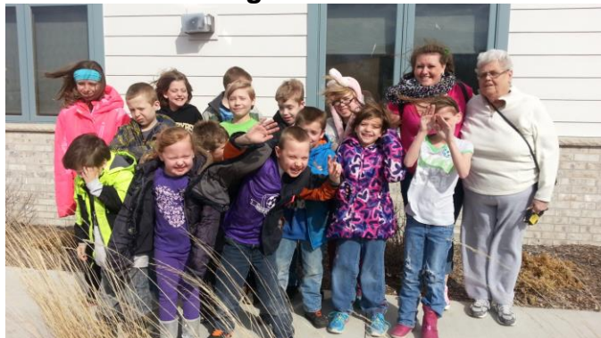
Getting Blown Away