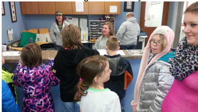
Learning About Almost Home