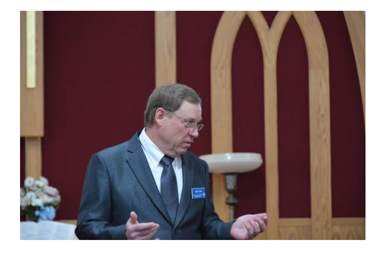
Stephen Ministry Sunday January 26

Check the bulletin board for more "thank yous"